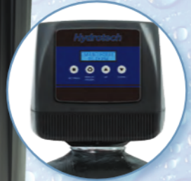
Also available with 785 valve